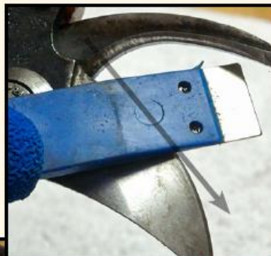
Sharpening in one stroke